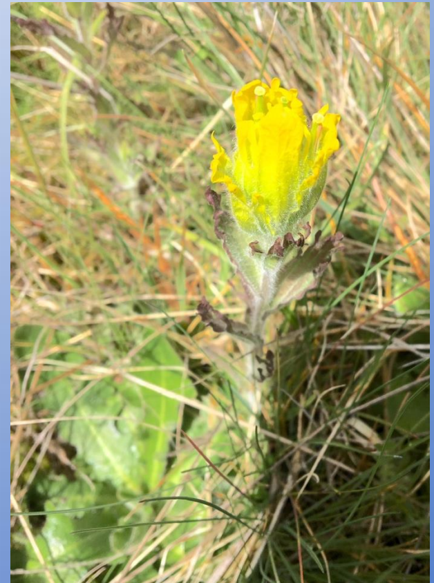
Yellow paintbrush, Native Oaks Ridge

Protect at least 16,880 acres of wildlife habitat by 2025, including a diverse assemblage of habitats distributed throughout the Willamette Basin; focusing on Conservation Opportunity Areas and Strategy Habitats in support of the Oregon Conservation Strategy; and supporting Strategy Species and ESA-listed species.