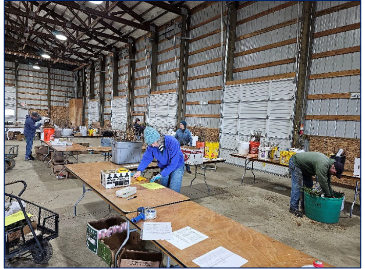
Winter Native Plant Sale 2024